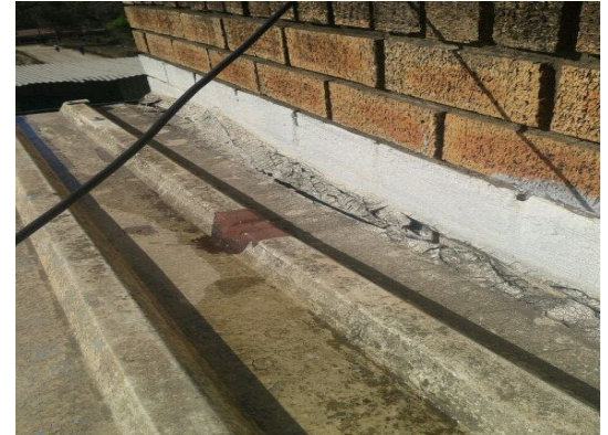
Failed waterproofing membrane and no metal flashings

For the long term performance of the sidewall detail, it is essential that all components are installed correctly. Should any of the components such as sealant tape, metal counter flashing or zed support be omitted then water will enter the detail.