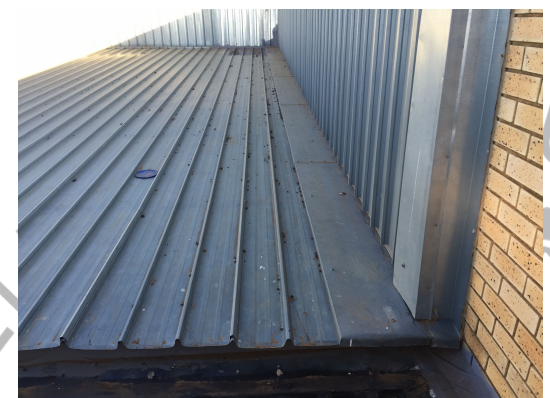
Metal sidewall flashing with vertical cladding