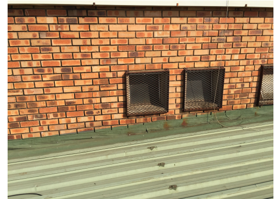
Failed metal flashing with waterproofing